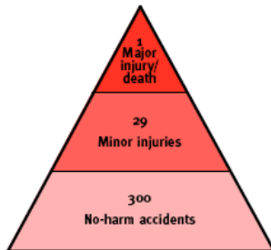
Figure 1. The Heinrich pyramid

Safety pyramid developed by Heinrich (1931)